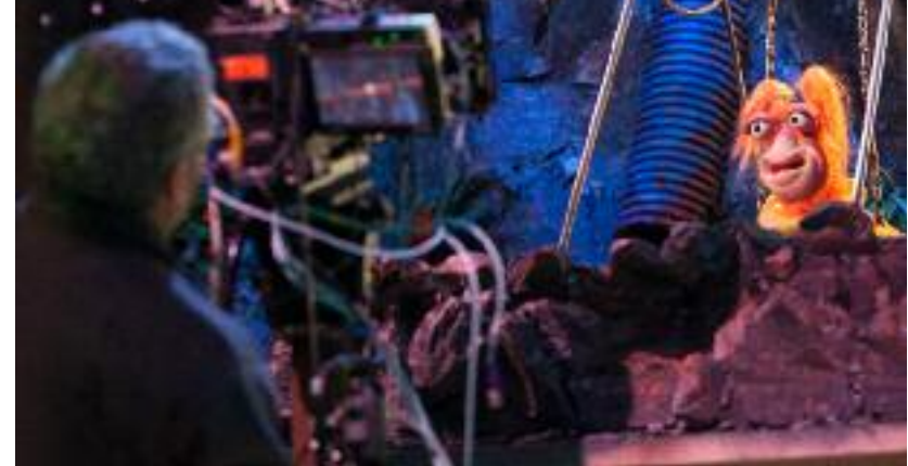
Saoil faoi Shráid

Is sna ceantair uirbeacha is mó atá infheistíocht ar siúl i gcliantchomhlachtaí seirbhíse intrádála idirnáisiúnta eolasbhunaithe agus is beag ceantar Gaeltachta ná tuaithe atá ábalta dul in iomaíocht